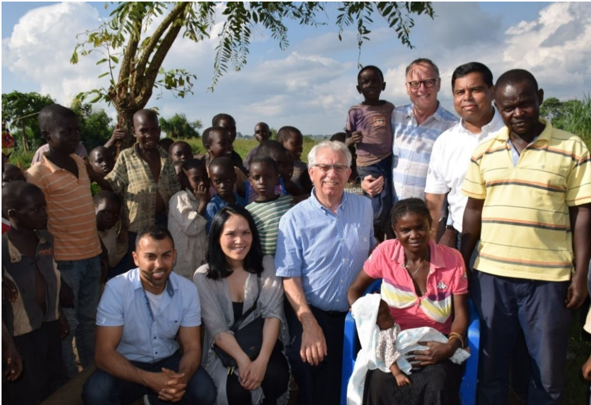
Figure 3 – Committee Members with Newly Arrived Refugee Family and Refugee Children