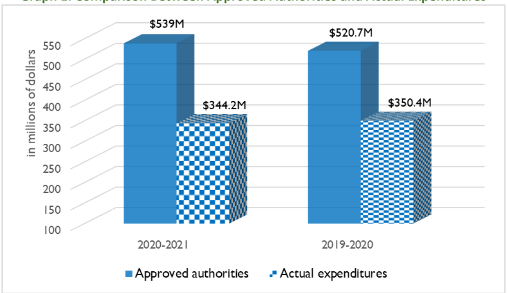
Graph 1. Comparison Between Approved Authorities and Actual Expenditures

The following graph provides a comparison between authorities approved for use by the Board and actual expenditures as at December 31 of fiscal years 2020-2021 and 2019-2020.