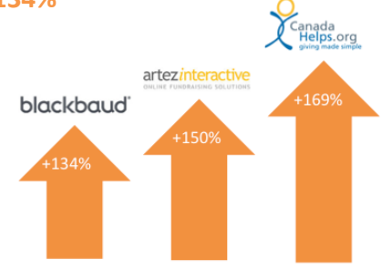
Increase in Online Donations Transactions

◆ CanadaHelps +169% (vast majority from new donors), Artez +150%, Blackbaud +134%