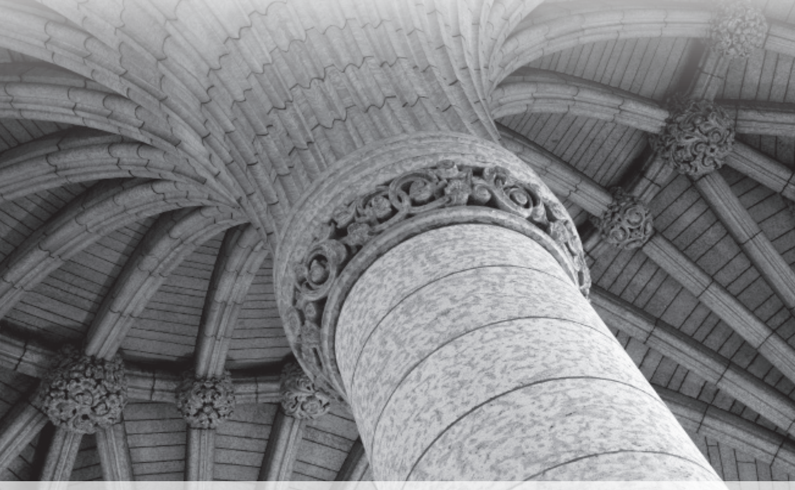
FEBRUARY 2019 42<sup>nd</sup> PARLIAMENT, 1<sup>st</sup> SESSION