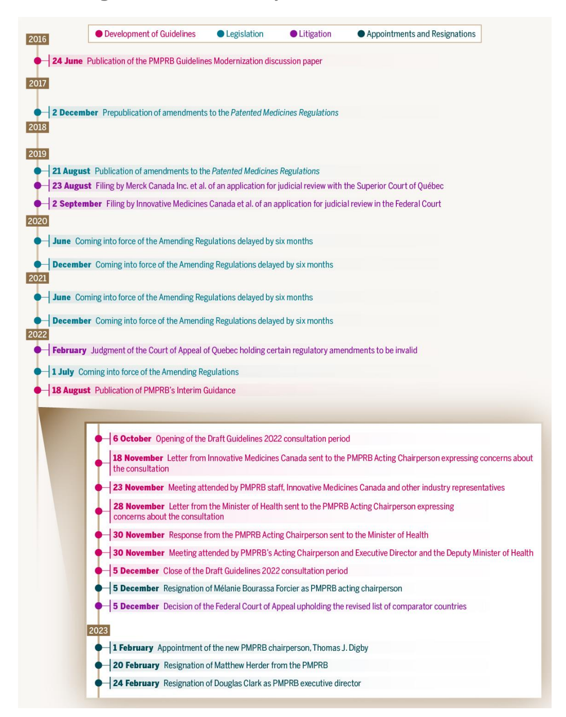
Figure 2—Timeline of Key Events in PMPRB Reforms